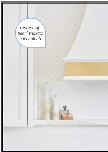
mother-of-pearl mosaic backsplash

Like a glamorous all-white outfit, this showstopper white kitchen is anything but bland thanks to layering tones, textures and materials. Natural stone, porcelain, lacquered cabinets, stainless steel appliances and satin brass accents add interest without cluttering the overall aesthetic. Functionality isn't forgotten: hard-working porcelain prep countertops are ample and accessible storage is abundant. The final result? Elegance with a touch of glamour.