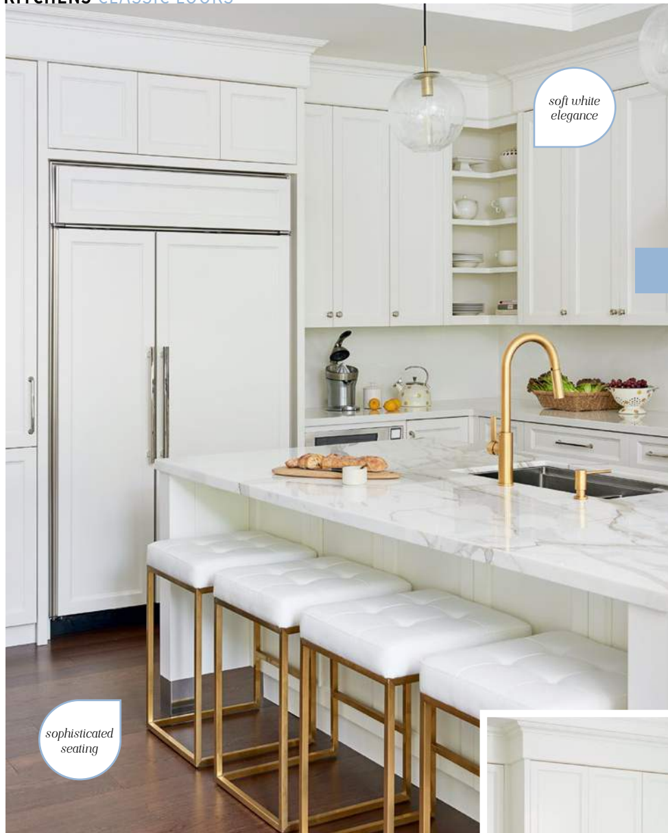
soft white elegance