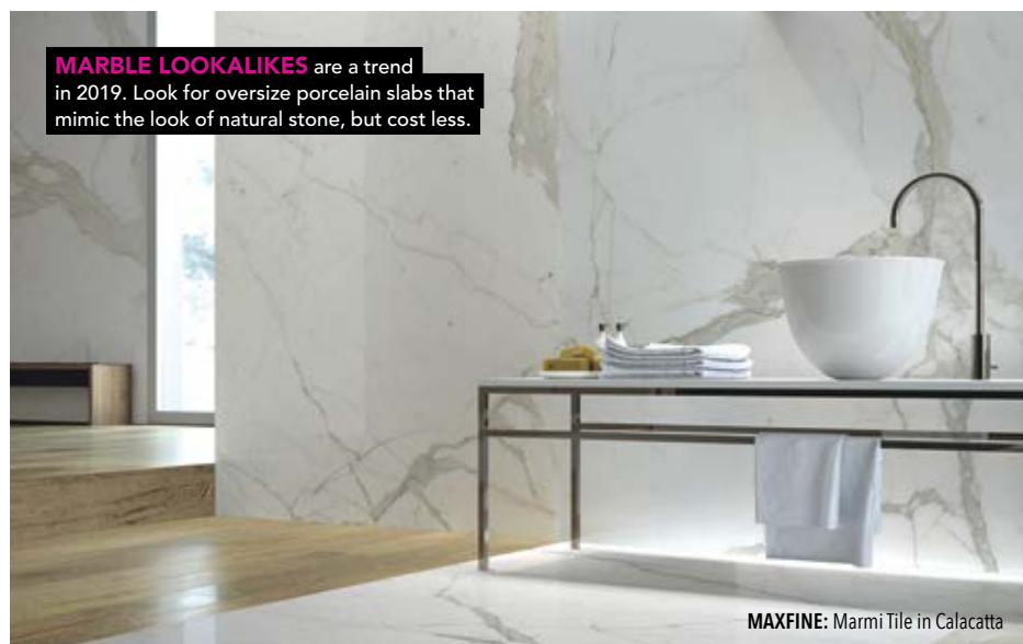
MARBLE LOOKALIKES are a trend in 2019. Look for oversize porcelain slabs that mimic the look of natural stone, but cost less.