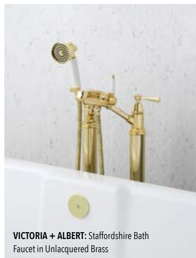
VICTORIA + ALBERT: Staffordshire Bath Faucet in Unlacquered Brass