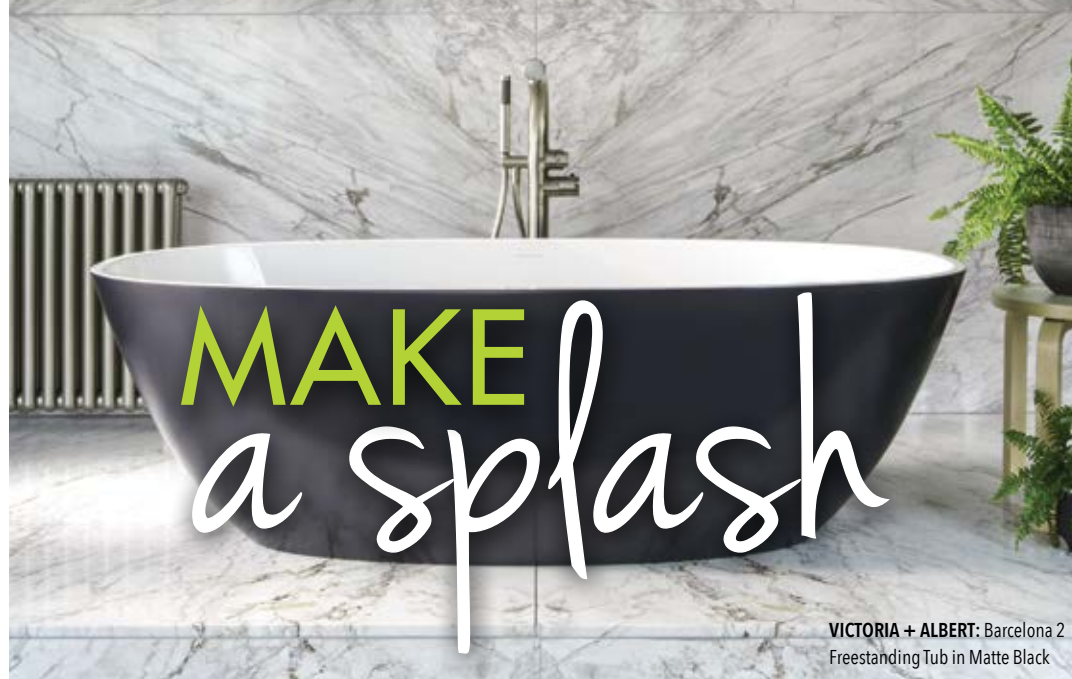
VICTORIA + ALBERT: Barcelona 2 Freestanding Tub in Matte Black

Luxury and art are dominant décor motifs for 2019. As bathrooms continue to be a big interior interest, people are seeking to inject high-end touches here and artful accents there. Here are six trending elements to keep an eye out for in the coming year and beyond.