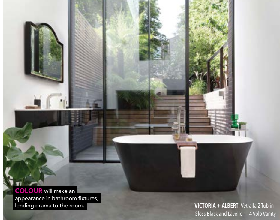
COLOUR will make an appearance in bathroom fixtures, lending drama to the room.

The bathroom is where you start every day. It's where you primp and pamper, ponder life, prepare to take on the world. This year, isn't it only fitting that this space lives up to your high standards, too? OH