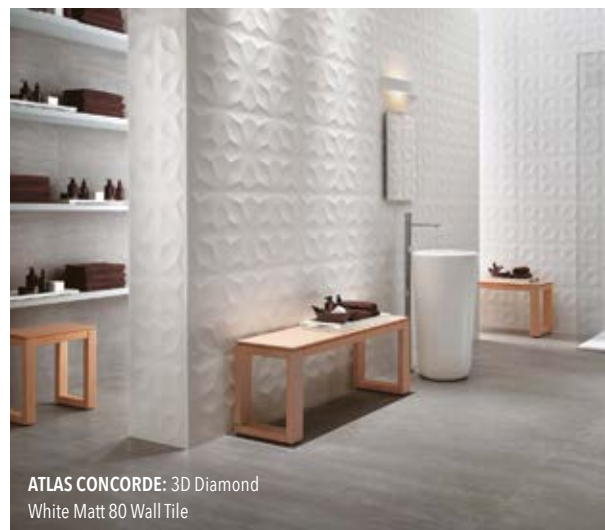
ATLAS CONCORDE: 3D Diamond White Matt 80 Wall Tile